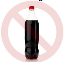
Pop 591 mL bottle